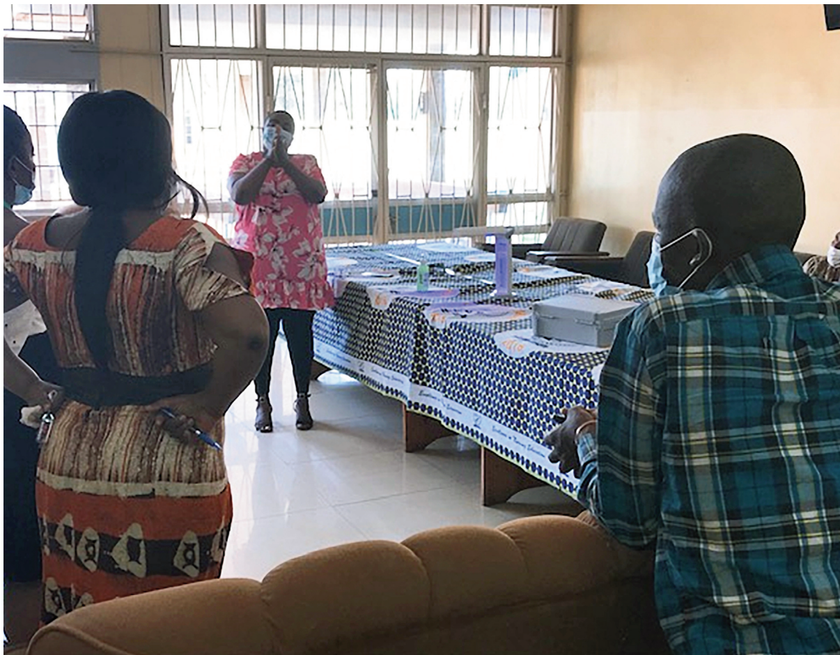
▲ Hand washing