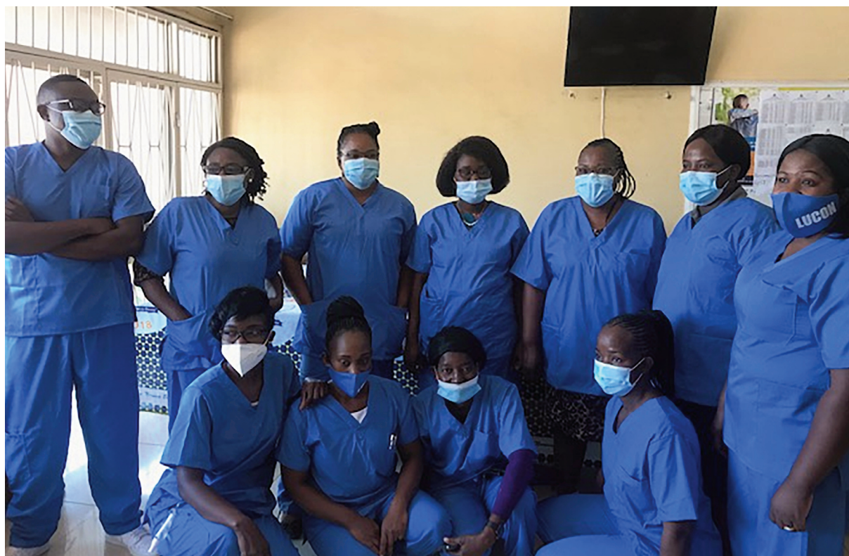
▲ Personal protective equipment