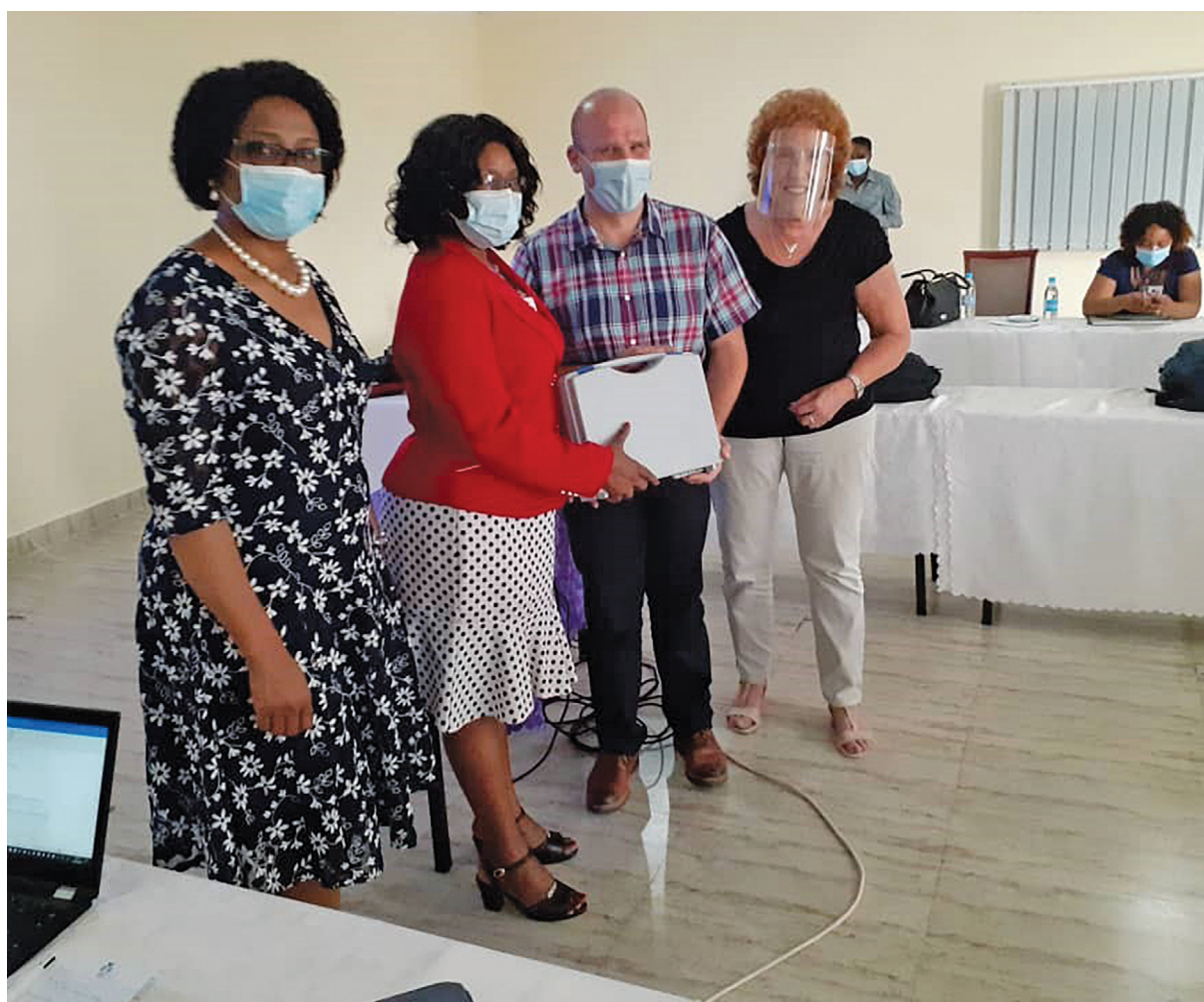
▲ Handing over of equipment