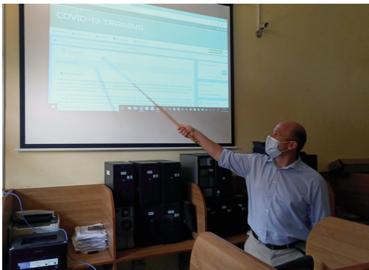
▲ A teaching session