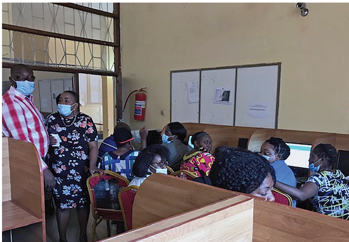
▲ Group work