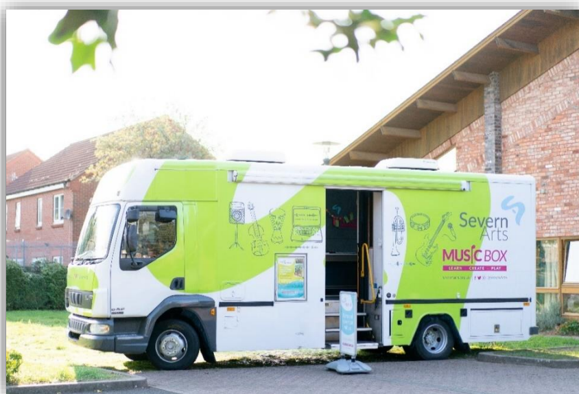
The Music Box at a Worcestershire Youth Centre

The final youth consultation took place in September 2022 on the Music Box 10 , Severn Arts' mobile music space which provides a range of musical pop up events and experiences in partnership with festivals, schools and community groups across the county. The consultation took place during a Music Box visit to a local youth centre as part of the centre's weekly activity evening for children and young people. Young people were invited to drop in and create their own music on digital equipment (including turntables and an electronic drum kit) with support from a music facilitator. The opportunity to lead a consultation in an unconventional space prompted the researchers to move away from traditional interview techniques. Instead, a series of consultation questions were prepared which were based on musical metaphors, an idea developed by Bresler (2005) which Leavy (2015: 130) defines as