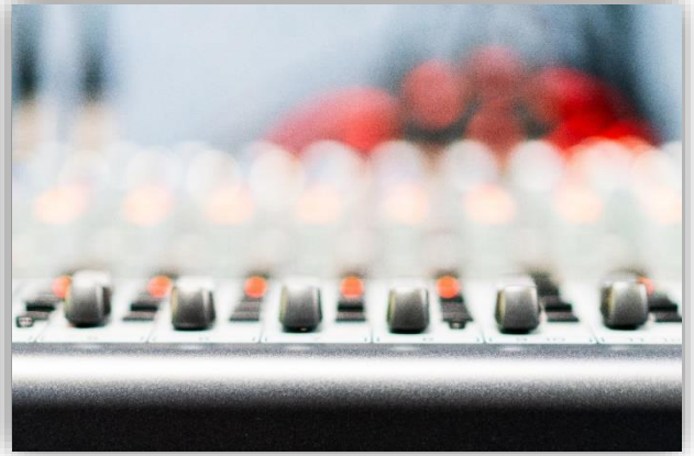
Music equipment on the Music Box